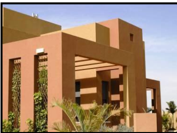
New home in Givot Bar

Continue to the new community of Givot Bar . In partnership with the OR Movement, JNF is developing communities for a new generation of modern-day pioneers who want an alternative to Israel's crowded and expensive center. Movement, JNF is developing communities for a new generation of modern-day pioneers who want an alternative to Israel's crowded and expensive center. Givot Bar is the first of these communities, and to some extent a model for other new housing developments, including Carmit.