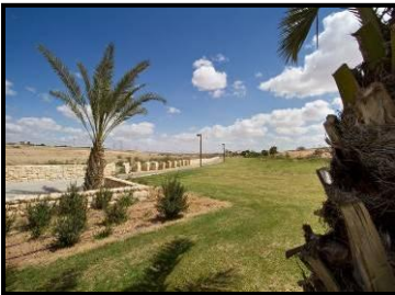
Be’er Sheva River Park

Continue to the Gateway to the Negev Information Center , established through a partnership between JNF and the OR Movement. A representative from the OR Movement will provide an overview of the various services the center provides to current and prospective Negev residents as well as tourists.