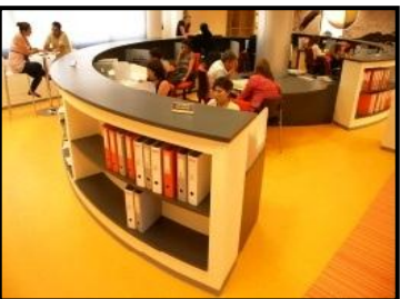
Gateway to the Negev Information Center