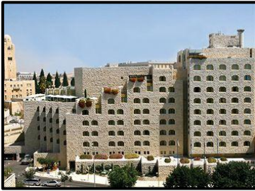
Dan Panorama Hotel

Overnight, Dan Panorama Hotel, Jerusalem