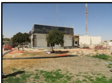
Progress of the Central Arava Medical Center

Afterward, depart for the Central Arava to see, first-hand, how JNF is transforming the region and revolutionizing the land and lives of the people who live there. Gain insight into the complex challenges and obstacles facing the region, hear updates on JNF's work to attract new residents and visitors to the region and see the progress and strides being made in the Arava.