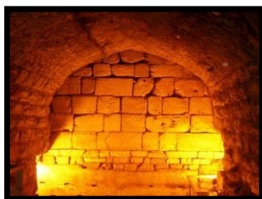
Western Wall Tunnel

Those of us participating on Track II will then continue to Ammunition Hill , site of the famous Six-Day War battle. A representative will lead us through the battleground and bunkers on a tour that follows the footsteps of the soldiers who fought here. We will see the new “Seam-Line” multimedia show about the Six-Day War and reunification of Jerusalem. The tour will conclude at JNF’s Wall of Honor , honoring Jewish veterans from around the world. Here we will reflect on the meaning of service and commitment to Israel and its freedom.