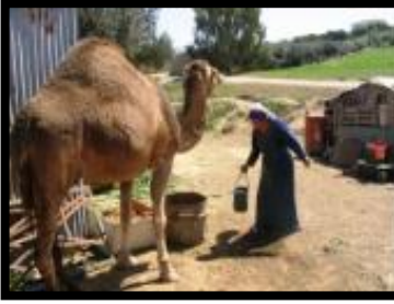
Project Wadi Attir

After checking out, we begin our day with a visit to the Bedouin community of Hura . After a tour, we will meet with residents and community leaders to gain a deeper understanding of the issues and challenges facing Israeli Bedouins. We will also learn about JNF's involvement in Project Wadi Attir, which seeks to develop and demonstrate a model for sustainable, community-based agriculture, adapted to a desert environment.