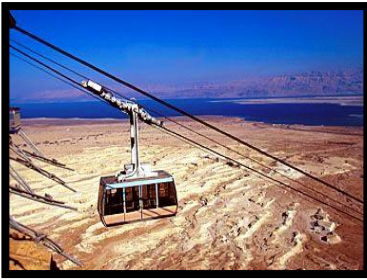
Cable car ride to Masada

Today will be at leisure in honor of Shabbat. Spend the day relaxing at the hotel, attend optional Shabbat services at a local synagogue or at the hotel, or consider participating in one of the following optional day tours :