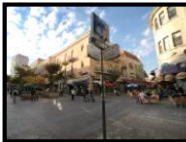
Ben Yehuda Street