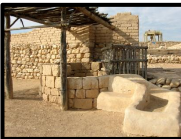
Tel Be'er Sheva

Following lunch, we will continue to Tel Be'er Sheva , where the ancient city of Be'er Sheva was located. During a tour of the ancient city, we will see the new Abraham's Well Visitor Center , which contains a well believed to have been dug by the patriarch Abraham.