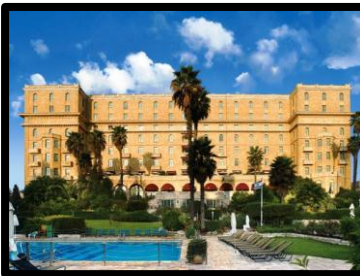
King David Hotel