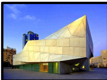
Tel Aviv Museum of Art

Next, we will proceed to Independence Hall to see where David Ben-Gurion announced the Independence of the State of Israel. During a tour, we'll be able to see how Israel's first modern city came to life.