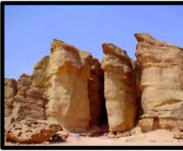
Solomon's Pillars at Timna Park