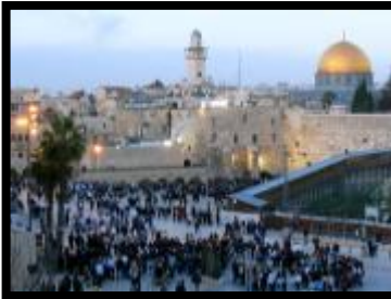
Kabbalat Shabbat at the Kotel