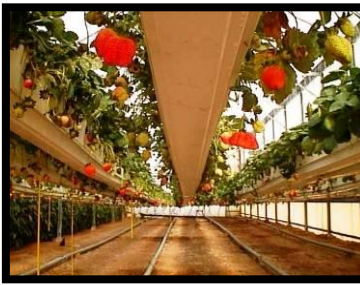
R & D Station