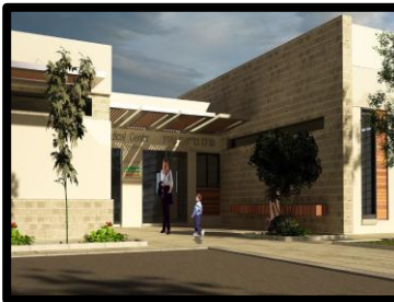
Central Arava Medical Center

We will proceed to the new Central Arava Medical Center in Sapir. In partnership with the Central Arava Regional Council and the Israeli government, JNF is building a world-class medical center to replace the dilapidated clinic and provide quality care to local residents and workers. Several Arava doctors will explain how the medical center will improve the quality of life and care for those who need it most.