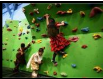
Sderot Indoor Recreation Center

Following breakfast, we will visit Aleh Negev , a state-of-the-art residential facility for people with severe cognitive and developmental disabilities. Located in Ofakim, Aleh Negev provides vocational training, occupational therapy and medical facilities. During a tour, a representative will show us where JNF is landscaping Aleh Negev's grounds, preparing infrastructure for new therapy buildings and housing, and raising funds to support vital enhancements including a hydrotherapy pool and a therapeutic riding camp.