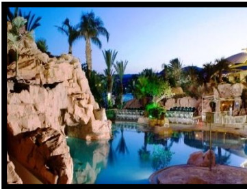
Dan Hotel in Eilat

Welcome to Israel! Our mission begins with dinner in a private room at the Dan Eilat Hotel **. Joining us for dinner will be a JNF representative , who will provide us with an introduction to the mission and overview of current JNF activities and work in Israel.