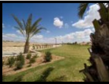
Be'er Sheva River Project

After checking out, we begin our day with a visit to the Bedouin community of Hura . After a tour, we will meet with residents and community leaders to gain a deeper understanding of the issues and challenges facing Israeli Bedouins. We will also learn about JNF's involvement in Project Wadi Attir, which seeks to develop and demonstrate a model for sustainable, community-based agriculture, adapted to a desert environment.