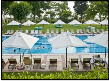
Carmel Forest Spa resort