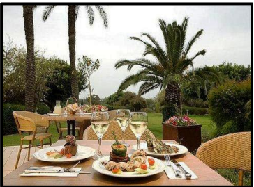
Tishbi Winery for lunch

Later this morning, visit the Atlit Illegal Immigration Camp , which JNF helped restore in partnership with the Society for the Preservation of Israel's Heritage Sites (SPIHS). Converted into a detention camp during the British Mandate, Atlit imprisoned thousands of Jewish immigrants upon their arrival into Israel. Participate in a "Breaking Out" activity , where you will divide into small groups and use provided data to plan your escape from the camp - the same way the Palmach did on that fateful day of October 9, 1945.