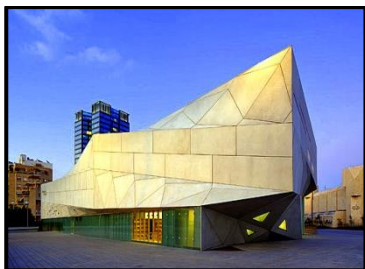
Tel Aviv Museum of Art