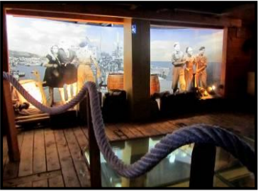
Atlit Illegal Immigration Camp

Following breakfast, visit the brand new state-of-the-art Usfiya Fire Station . Following a tour, meet several Israeli fire fighters, who will share their personal experiences and stories. See an exciting demonstration of their unique skills the firefighters use to save the land and people of Israel. Afterward, take advantage of a unique opportunity to jump in the driver's seat of a fire truck!