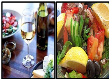
Fresh, local dishes and wine