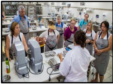
Dan Gourmet School

Following breakfast and hotel check-out, proceed to a tour of the Shmurah Matzah factory. Witness the intricate process of crafting fresh, handmade matzah from scratch by watching the ingredients from the moment of harvesting and drawing.