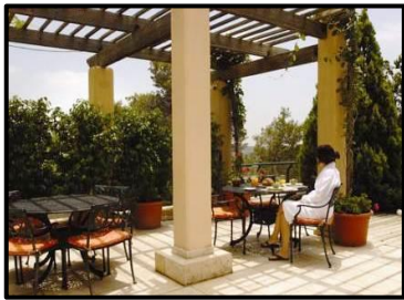
Carmel Forest Spa resort