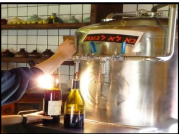
Wine Bottling Activity

Continue to the nearby Tishbi Estate for lunch and a wine tasting at the Tishbi winery, which overlooks the estate's vineyards. Dine on local cuisine including fresh vegetables, homemade bread and fresh cheeses from the nearby Yaakob and Meiri Dairy farms. Taste some of the spectacular wines produced here before participating in a special wine bottling activity, complete with personalized wine labels .