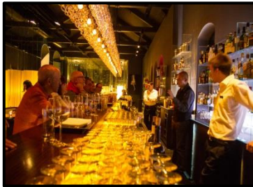
Messa Restaurant & Bar

Afterward, check into the trendy Royal Beach Hotel , situated along the Mediterranean.