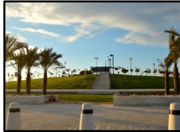
Be'er Sheva River Park

Following breakfast, depart the hotel and head south toward the Negev . Begin at Aleh Negev , a state-of-the-art residential facility that provides people with severe cognitive and developmental disabilities with high level medical and rehabilitative care. A revolutionary facility that has changed the face of rehabilitative care in Israel, Aleh Negev is home to over 500 residential adults with disabilities and serves more than 12,000 children and young adults with disabilities each year on an outpatient basis.