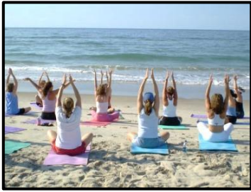
Yoga on the beach