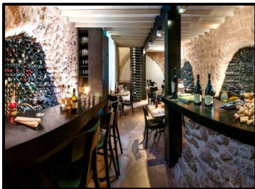
Wine Tasting at Efendi Hotel

Following breakfast, depart the hotel and make your way to the Western Galilee . Visit the Bouza Ice Cream Parlor for a special ice-cream making workshop . Founded by an Arab Muslim and a Jewish kibbutznik, the ice cream shop attracts a diverse clientele of Muslims, Christians and Jews from Israel and abroad. During a conversation with the restaurant's owners, understand how Bouza embodies peaceful coexistence and reflects the diverse and complex nature of Israeli society.