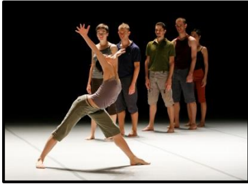
Batsheva Dance Company rehearsal

Afterward, make your way to Tel Aviv , Israel's most cosmopolitan city situated along the sparkling waters of the Mediterranean Sea. Visit the esteemed Dan Gourmet School of Kosher Culinary Arts for an interactive cooking class featuring authentic, traditional and modern Israeli dishes.