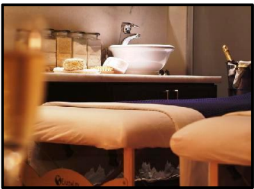
Spa at Carmel Forest