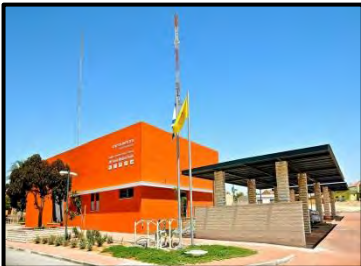
Central Arava Medical Center