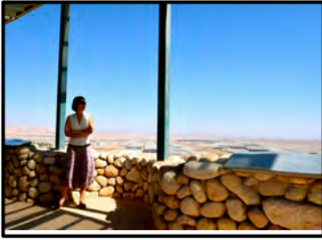
Central Arava, Paran Overlook

Start the morning with a visit to the Paran Overlook in the Central Arava and learn about the region's growth and vital importance to the country.