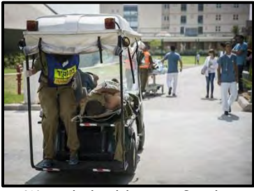
Wounded soldiers at Soroka Medical Center