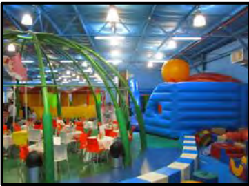
Sderot Indoor Recreation Center

Following breakfast, depart the hotel and head south to the Negev. Stop in Sderot for a visit to JNF's Sderot Indoor Recreation Center , the largest indoor playground in Israel. This fortified facility provides Sderot's youth with a safe, secure place to have fun and simply be children. After the tour, head to the center's therapy rooms to meet with staff psychologists to learn about their work with local children and families traumatized by the recent war with Hamas in Gaza.