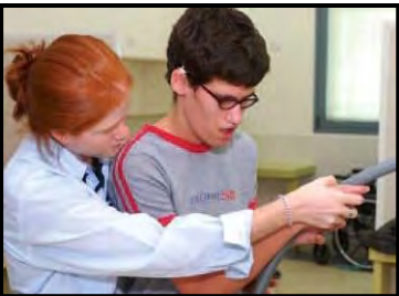
Aleh Negev Rehabilitative Village

Following breakfast, depart the hotel and head south to the Negev. Stop in Sderot for a visit to JNF's Sderot Indoor Recreation Center , the largest indoor playground in Israel. This fortified facility provides Sderot's youth with a safe, secure place to have fun and simply be children. After the tour, head to the center's therapy rooms to meet with staff psychologists to learn about their work with local children and families traumatized by the recent war with Hamas in Gaza.