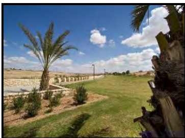
Be'er Sheva River Park

Next, enjoy lunch and home hospitality at the home of a local resident. Enjoy a delicious meal with authentic Israeli food.