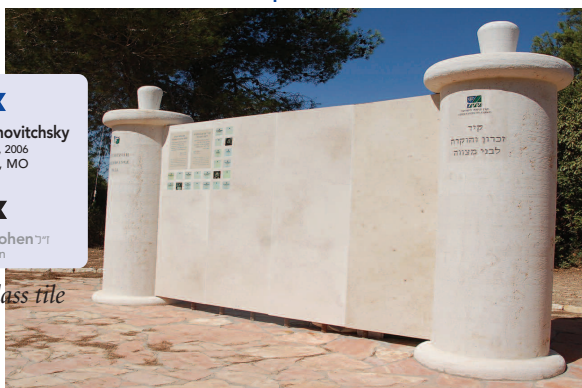
B'nai Mitzvah Remembrance Wall in Jerusalem