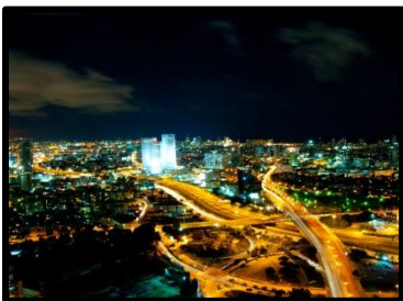
Tel Aviv at night

Later on, enjoy dinner at leisure and explore Tel Aviv's exciting night life at your own pace.