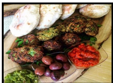
Home hospitality dinner