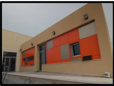
Halutza Medical Center