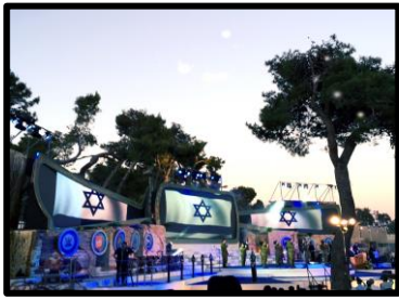
Jerusalem Day Ceremony at Ammunition Hill