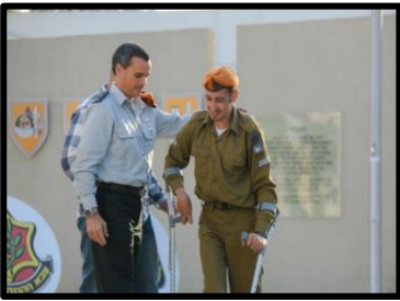
Special in Uniform