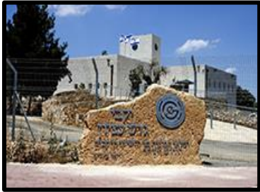
Gush Etzion Visitor Center