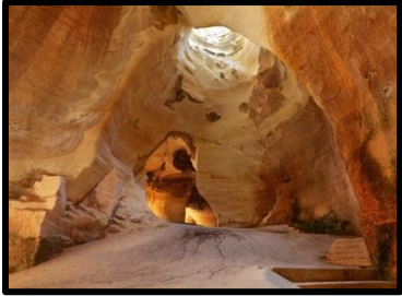
Beit Guvrin National Park

Explore the wondrous Beit Guvrin Caves at Beit Guvrin National Park, recently declared a UNESCO World Heritage Site in 2014. Make your way through this spectacular archaeological phenomenon that bears witness to the region's tapestry of cultures and evolution over the past 2,000 years, dating back to the 8th century BCE.