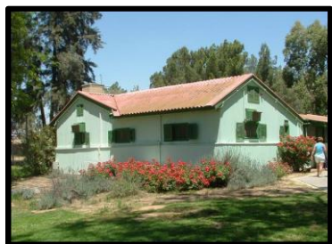
Ben Gurion's hut