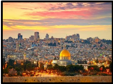
Jerusalem view from Mt. Scopus

Afterward, proceed to Jerusalem , the religious and spiritual hub of Israel. Upon arrival, partake in a traditional Shehecheyanu ceremony on Mt. Scopus while taking in a spectacular panoramic view of the holy city.