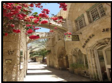
Old City of Jerusalem