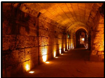
Western Wall Tunnels

This evening features an exciting night tour of the Western Wall Tunnels , an incredible labyrinth of underground arches, tunnels, and passageways. Alternatively, see the Sound and Light Show at the Citadel, which tells the story of Jerusalem through breathtaking virtual reality images and sounds.