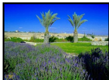
Be'er Sheva River Park