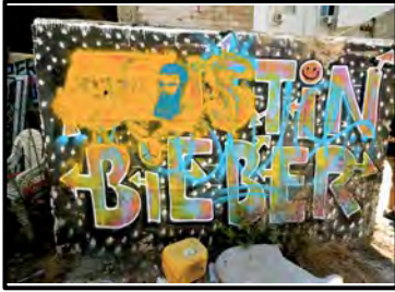
Graffiti in Florentin

After a relaxing breakfast at Bnei Dan, start the day with the option of a graffiti tour of the Florentin neighborhood or join some of the group at the world famous Pride Parade in Tel Aviv.