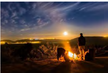
Hashomer Hachdash Bonfire

Continue north to Akko, an underground crusader city and a UNESCO World Heritage Site. Akko has a fascinating history, with a rare blend of influence from both the east and west and also serves as a unique meeting place of art and religion, as well as contemporary living cultures and communities. Take a tour through the Old City and explore the gates, towers, tunnels and secret passageways of this ancient city. Check out the Crusader fortress, stroll through the shuk and witness the impressive remains built by the Hospitaller Order of Knights in the 12th and 13th centuries.