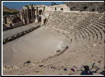
Ruins in Beit She'an

Following an awesome morning the group will visit the famous Beit She'an National Park, the second largest national park in Israel. Established in the 5th century B.C. on a hilltop south of Nahal Harod, this park is one of the world's largest archaeological sites containing an entire Roman-Byzantine city. Climb atop the high mound that provides a breathtaking view of the Beit She'an Valley landscape.