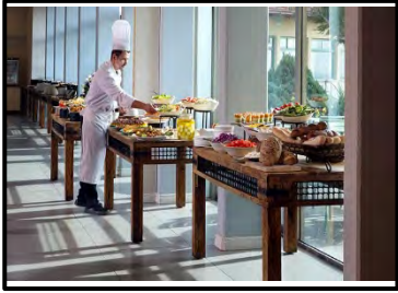
Kibbutz Nir Etzion

After breakfast travel to meet HaShomer HaChadash to help work the land. HaShomer HaChadash is a young, grassroots volunteer organization established in 2007 to help farmers and ranchers in the Negev and the Galilee who administer vast tracts of state-owned land to deal with the threat of illegal seizure of their land. Like the original Guardsmen who protected remote Jewish settlements 100 years ago, HaShomer HaChadash works to ensure a stronger Jewish presence in the Negev and the Galilee and uphold the Zionist ideals on which the State of Israel was founded.