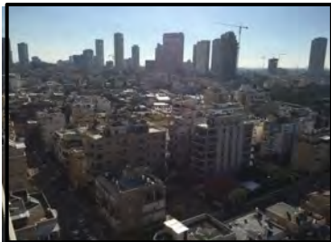
Tel Aviv Skyline

After free time the group will participate in Kabblat Shabbat and Shabbat Dinner with White City Shabbat and JNFuture Tel Aviv . White City Shabbat is the portal for Jewish Life in the White City. Bringing the concept of non-denominational Shabbat dinner parties to a wider community, the organization hosts its own private, warm, welcoming, pluralistic, all-inclusive Shabbat meals every month. White City Shabbat also hosts holiday celebrations and meals, Jewish learning series, beginners learning minyan, and inter-community programming.