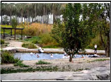
Valley of the Springs

Next, visit Sde Trumot, located in the Beit She'an Valley. Founded in 1951 by Jewish immigrants, the moshav is one of four moshavim in the "Bikurah" bloc. Wrap up the day with dinner and folklore with a Kurdish family in Moshav Rehov, also part of the "Bikurah" bloc. Moshav Rehov is a modern community situated in Tel Rehov, a large mound located in the Beit She'an Valley with deep archeological and historical ties.