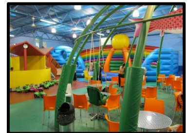
Sderot Indoor Playground