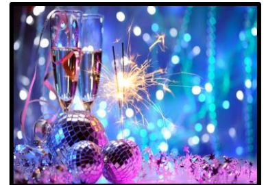
Happy New Years!