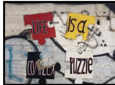
Street Graffiti in Tel Aviv