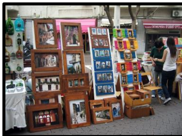
Nachalat Binyamin Fair