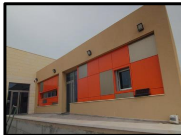
Halutza Medical Center