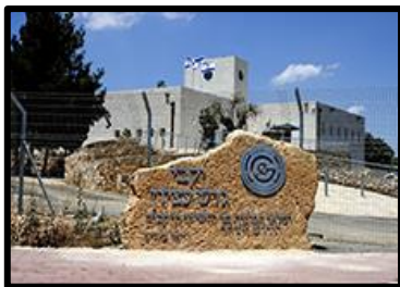
Gush Etzion Visitor Center