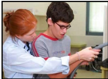
Aleh Negev Rehabilitative Village

Afterward, continue south to Sderot for a visit to JNF's Sderot Indoor Recreation Center , the largest indoor playground in Israel. This fortified facility provides Sderot's youth with a safe, secure place to have fun and simply be children. Take a tour and meet several Sderot residents to learn how the recreation center has impacted their lives.