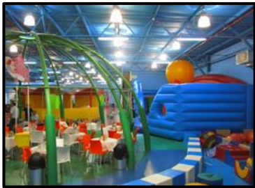
Sderot Indoor Recreation Center