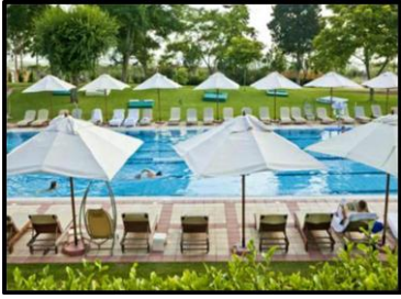
Pool at the Carmel Forest Spa