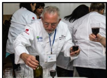
Learning about wine pairings

As the sun sets, mark the end of Shabbat by participating in the ritual of Havdalah , a service infused with music, symbols and meaning. Recite the blessings, sing the prayers and learn more about the role of spices in the service.