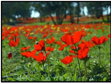
Flowers in the Carmel Forest