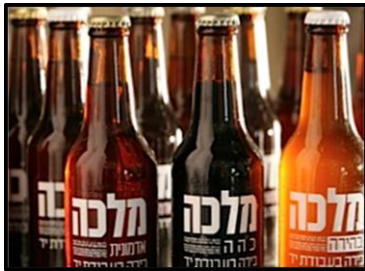
Beer from Malka Brewery

Proceed to Aluma Restaurant , located within the Arab village of Tarshiha. Founded as a partnership between an Arab Muslim and a Jewish kibbutznik couple, the restaurant attracts a diverse clientele of Muslims, Christians and Jews from Israel and abroad. During a conversation with the restaurant's owners, understand how Aluma embodies peaceful coexistence and reflects the diverse and complex nature of Israeli society. Afterward, meet Aluma's chef for an interactive cooking class featuring traditional Arab and Jewish dishes.