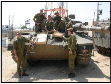
IDF Base and Soldiers

Later this afternoon, visit a nearby IDF Army Base . Spend time getting to know some of the lone soldiers who have left their family and friends in the United States to serve the State of Israel.