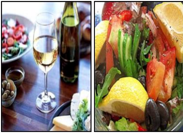
Fresh, local dishes

Today will be at leisure in honor of Shabbat. Consider attending optional Shabbat services, relaxing in the hotel’s tranquil atmosphere, taking a dip in the pool or indulging in an optional spa treatment* ( *additional cost - not included in mission price ).