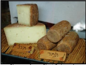
Cheese from Shai Seltzer's Goat Farm