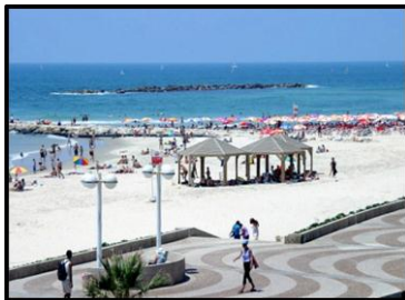
Tel Aviv Beach

Early this morning, everyone is invited to join an optional yoga class on the beach. Following breakfast, meet one of Israel’s leading culinary journalists, food critics and television personalities, Gil Hovav ( pending confirmation ). Known for his impact on Israel’s food culture, he played a major role in transforming Israel into a “gourmet nation.” He will lead a tour through a local food market and help create a menu for this afternoon’s barbeque on the beach. During the excursion, purchase all of the necessary ingredients to prepare each dish.