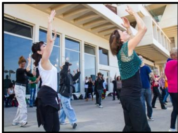
Folk Dancing class

Afterward, head to Tel Aviv, Israel's most cosmopolitan city situated along the waters of the Mediterranean Sea. Take a late morning Israeli folk dancing class with a professional instructor before a special lunch activity in Tel Aviv.