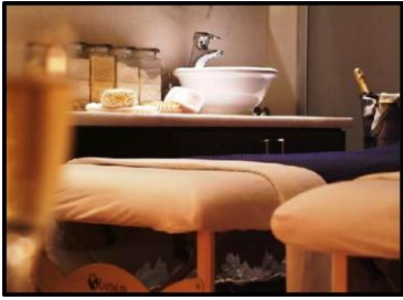
Spa at Carmel Forest

Welcome to Israel! This afternoon, meet the group in the lobby of the Carlton Hotel in Tel Aviv ( exact time TBA ) before transferring north to the luxurious Carmel Forest Spa in Haifa . This evening, recite Shabbat blessings and participate in the candle lighting before enjoying a Shabbat dinner at the hotel. During dessert, a special guest speaker will lead an in-depth discussion on “How Israel’s changing demographics enriches her cultural soul.”