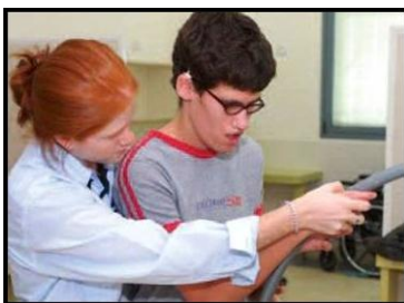
Aleh Negev Rehabilitative Village

Following breakfast, depart the hotel and head south toward the Negev . Begin at Aleh Negev , a state-of-the-art residential facility that provides people with severe cognitive and developmental disabilities with high level medical and rehabilitative care. A revolutionary facility that has changed the face of rehabilitative care in Israel, Aleh Negev is home to over 500 residential adults with disabilities and serves more than 12,000 children and young adults with disabilities each year on an outpatient basis.