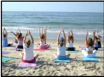
Yoga on the Beach