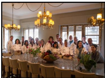
Enjoying dinner together

This evening, join Chef Hila Solomon for a special culinary experience at her restaurant, Spoons , located in a historic residence in the picturesque neighborhood of Yemin Moshe. During dinner, hear from a top culinary expert about one of the top international food trends for 2014: "New Israeli" cross-cultural cuisine. Families fleeing turmoil in Tunisia, Egypt, Iran and Iraq are bringing their food to Israel. As a result, Israeli chefs and foodies are absorbing ideas and techniques from all over the Middle East to create a new twist on traditional dishes. During a special hands-on activity, consider the ways that food can minimize conflict by bringing diverse cultures together and what that might mean for the future.