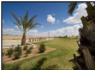
Be'er Sheva River Park