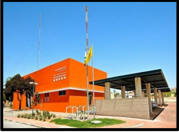
Central Arava Medical Center

Early this morning, embark on an optional jeep tour ride at sunrise of the Ramon Crater , the world's largest erosion crater (or "makhtesh"). Take in the breathtaking views of this geological phenomenon and ride along the same spice route that ancient merchants traveled thousands of years ago.