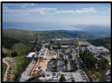
Ziv Medical Center

Afterward, visit the gleaming white cliffs of Rosh Hanikra for a tour of these artificial tunnels and view caverns, carved out by the pounding waves of the Mediterranean. The grottoes and caves at Rosh Hanikra are the result of thousands of years of the power of the sea. After a short yet exhilarating cable car ride down the cliff face, explore these incredible formations as you embrace the unique landscape and atmosphere.