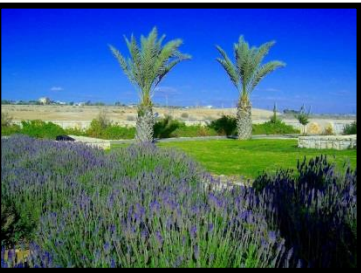
Be'er Sheva River Park

Proceed to Be'er Sheva , the capital of the Negev, for a drive-through tour of Be'er Sheva River Park , the centerpiece of JNF's efforts to provide a renaissance for the city. Learn how the river park has transformed from a wasteland and dumping ground to an anchor of recreation and tourism.