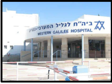
Galilee Medical Center