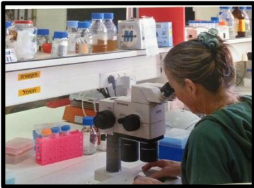
Lab at Yair R & D

Following breakfast and hotel check-out, depart for Sapir to see the new, state-of-the-art Central Arava Medical Center . In partnership with the Central Arava Regional Council and the Israeli government, JNF has built this world-class medical center to replace the dilapidated clinic and provide quality care to local residents and workers. Meet local doctors who will share how the medical center has provided much-needed services and support for the region.