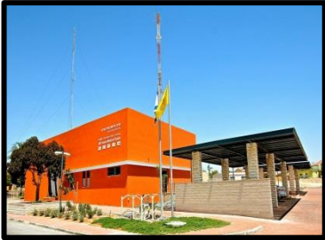
Central Arava Medical Center

Early this morning, embark on an optional jeep tour ride of the Ramon Crater , the world's largest erosion crater (or "makhtesh"). Take in the breathtaking views of this geological phenomenon and ride along the same spice route that ancient merchants traveled thousands of years ago.