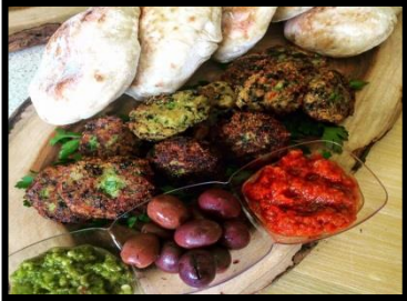
Home hospitality lunch