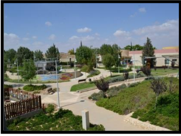
Aleh Negev village