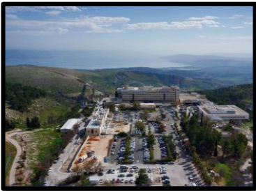
Ziv Medical Center

Afterward, continue to the gleaming white cliffs of Rosh Hanikra for a tour of these artificial tunnels and view caverns, carved out by the pounding waves of the Mediterranean. The grottoes and caves at Rosh Hanikra are the result of thousands of years of the power of the sea. After a short yet exhilarating cable car ride down the cliff face, explore these incredible formations as you embrace the unique landscape and atmosphere.