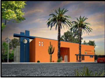
Central Arava Medical Center

This morning, consider an optional spa treatment at the hotel spa. Afterward, begin today with a visit to Park Yahel , a five-acre tourist complex and park at the entrance to Kibbutz Yahel in the Central Arava. Learn how the park is creating scores of jobs for kibbutz members and local residents, as well as impacting the Arava's economy.