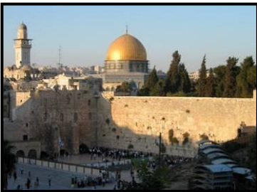
Old City of Jerusalem

Meet top doctors who made Aliyah from the United States to Israel. Each participant will be matched with another medical professional who shares the same (or similar) specialty. Each participant will have the opportunity to spend the day shadowing their corresponding doctor. Hear their personal and professional stories, watch them in action, share knowledge and gain insight in the daily lives of these doctors in Israel.