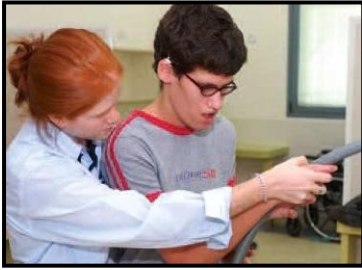
Aleh Negev Rehabilitative Village

Following breakfast, depart the hotel and head south to the Negev. Visit Aleh Negev , a state-of-the-art residential facility that provides people with severe cognitive and developmental disabilities with high level medical and rehabilitative care. Join several doctors, physical therapists and other medical professionals on a tour of the state-of-the-art facility that provides occupational therapy, medical facilities and vocational training.