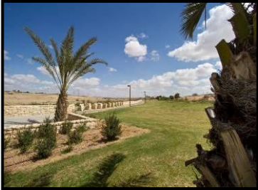
Be'er Sheva River Park

Following breakfast, depart the hotel and head south to the Negev. Visit Aleh Negev , a state-of-the-art residential facility that provides people with severe cognitive and developmental disabilities with high level medical and rehabilitative care. Join several doctors, physical therapists and other medical professionals on a tour of the state-of-the-art facility that provides occupational therapy, medical facilities and vocational training.