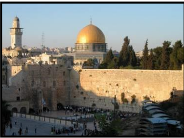
Old City of Jerusalem