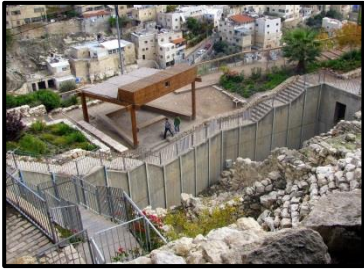
City of David

Following a delicious Israeli breakfast, hear from a special guest speaker who will discuss Israeli land ownership laws and the current dispute over the land rights at the City of David.