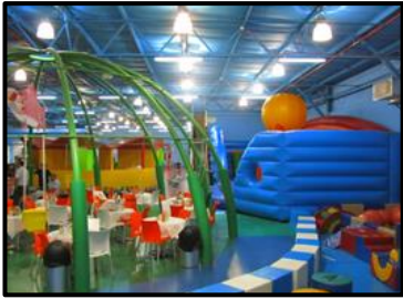
Sderot Indoor Recreation Center