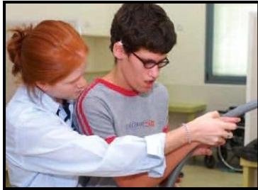
Aleh Negev Rehabilitative Village

Afterward, continue south to Sderot for a visit to JNF's Sderot Indoor Recreation Center , the largest indoor playground in Israel. This fortified facility provides Sderot's youth with a safe, secure place to have fun and simply be children. Take a tour and meet several Sderot residents to learn how the recreation center has impacted their lives.