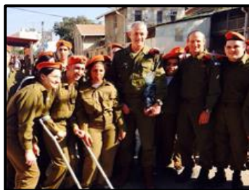
Special in Uniform