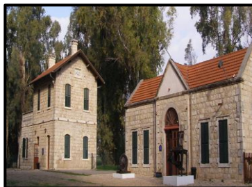
Valley Train Station