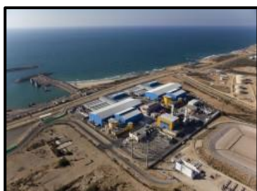
Ashkelon Desalination Plant