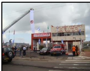
Usafiya Fire Station

Next, visit the new state-of-the-art Usafiya Fire Station , which serves as a lifeline of aid for the Carmel area still recovering from devastating life and property loss as a result of the 2010 Carmel Forest fire. Meet several firefighters, hear their personal stories, and tour the station and firetrucks.