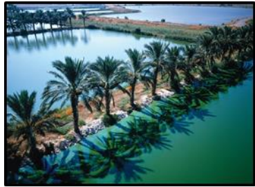
Valley of Springs

Following a delicious Israeli breakfast, depart for Haifa and take in the breathtaking panoramic view from the Baha'i Gardens . Take advantage of this perfect picture-taking opportunity at a UNESCO World Heritage Site that is described as the “eighth wonder of the world.”