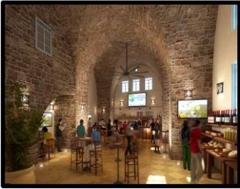
Western Galilee Visitor Center

Continue to the Western Galilee Visitor Center , a beautiful new multi-media facility that showcases the vast array of activities and attractions in and around the Western Galilee. See how this dynamic facility educates and inspires the 2.5 million tourists passing through Akko each year. Hear about the role it plays in JNF's goal to bring 300,000 new residents to the Galilee, strengthening the economic and social quality of life for everyone in the region.