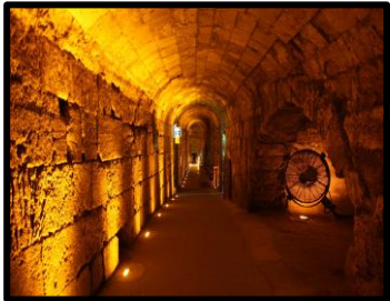
Western Wall Tunnels

Afterward, continue to the Old City of Jerusalem for a comprehensive tour. Explore the Jewish & Christian Quarters in all of their history and wonder. Hear the soft sounds of prayer and contemplation at the Western Wall before taking an exciting tour through the Western Wall Tunnels , an incredible labyrinth of underground tunnels, arches and passageways. Visit the Southern Wall Excavations and see the original steps that lead to the Temple Mount. Enjoy an authentic falafel lunch on own in the Old City.