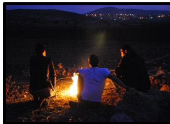
Bonfire & Dinner

Spend the remainder of the evening with one of JNF's newest partners HaShomer HaChadash . Established in 2007, HaShomer HaChadash, or the "The New Guardians," is a volunteer organization dedicated to safeguarding the land in the Negev and Galilee. Hear how this unique program provides participants with the opportunity to work the land, learn about Zionism and the history of Israel, and become leaders of social change. Engage with young leaders over a bonfire and dinner , a tasty Galilean beef stew prepared by the volunteers themselves.