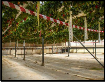
Yair R&D Center

Following breakfast at the hotel, depart south for the Arava, where you will see first-hand the groundbreaking initiatives underway that aim to double the region's population over the next decade as part of JNF's Blueprint Negev campaign.