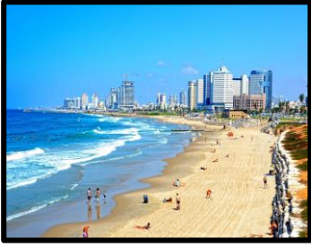
Tel Aviv beach

Today will be at leisure in honor of Shabbat. Optional Shabbat services will be offered at the hotel. Explore Tel Aviv on your own, spend the day at the beach, or participate in one of the following optional activities :