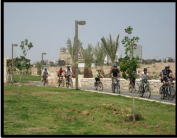
Be'er Sheva River Park