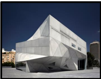
Tel Aviv Museum of Art

OPTION 1: Spend the day at Masada and the Dead Sea .* The bus will depart from the hotel in the morning and drive via the Judean Hills along the shores of the Dead Sea, the lowest place on Earth. Continue to Masada, the mountain fortress built by King Herod, where the Zealots made their last stand against the Romans. Learn about the history of the Jewish fighters before taking a cable car ride to the top of the Herodian Palace Complex. Afterward, descend the mountain to the depths of the Dead Sea. Take a swim in the buoyant waters or simply relax at the beach.