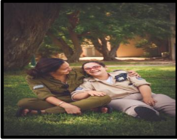
Special in Uniform