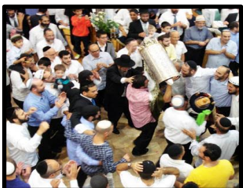
Simchat Torah festivities