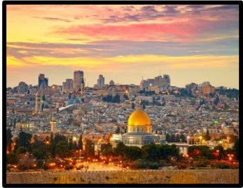
Old City of Jerusalem

Following breakfast and hotel check-out, depart for Jerusalem. Today will begin with a solemn tour of the Yad Vashem Holocaust Museum & Memorial . A sprawling complex of tree-studded walkways leading to museums, exhibits, archives, monuments and memorials, Yad Vashem tells the story of the Holocaust from a uniquely Jewish perspective, emphasizing the experiences of survivors through original artifacts, testimonies & personal possessions.