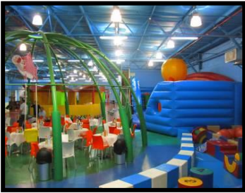
Sderot Indoor Recreation Center

Visit the one-of-a-kind village of Aleh Negev , a JNF partner organization that provides high-level medical services and unparalleled rehabilitative care to children with severe cognitive and physical disabilities. Tour the various therapeutic amenities such as the petting zoo, horseback riding center, and hydrotherapy pool. Hear about how the beautifully landscaped grounds of Aleh Negev were meticulously constructed to positively stimulate the senses through the use of natural herbs and flower gardens.