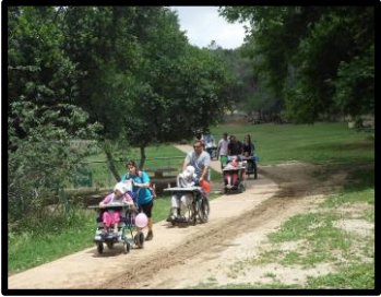
Inclusive Walking Trail

Along the scenic coastal route lies Zichron Yaakov , a charming village filled with culture and history. Tour through the pedestrian cobblestone streets to see stunning views of the Mediterranean shore, explore the quaint brick-paved downtown district, and learn about the town's rich Zionist history.