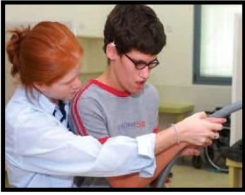
Aleh Negev Rehabilitative Village

Following breakfast and check-out, depart south for the Negev, where you will get an insider's view into how the region is transforming from a barren desert into an attractive place to call home for the next generation of Israeli residents.