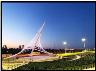
Be'er Sheva Amphitheater

Following an early 5:30pm dinner at the hotel, depart to Halutza , where 21st century pioneers are transforming this remote corner of the Negev desert into viable, vibrant communities. Meet with local residents to celebrate the holiday of Sukkot and observe Simchat Torah , the completion of the annual Torah reading cycle. Enjoy a festive evening filled with dancing, singing and time-honored traditions for an unparalleled authentic experience of this joyous occasion that gives thanks to the fall harvest.