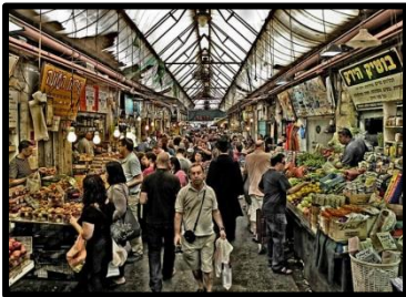
Mahane Yehuda Market

Proceed to Pat Bamelach, an artisan bread bakery in the heart of Gush Etzion. Engage in a fun, interactive pretzel-making workshop , where you will shape, boil, salt, and bake delicious sourdough pretzels with local bakers.