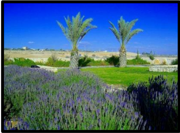
Be'er Sheva River Park

Following breakfast and checkout, depart south at 9:30am for Beit Guvrin National Park and explore the wondrous Beit Guvrin Caves , recently declared a UNESCO World Heritage Site in 2014. Make your way through this spectacular archaeological phenomenon that bears witness to the region’s tapestry of cultures and evolution from more than 2,000 years ago. Learn about how these approximately 200 multipurpose caves served as cisterns, oil presses, baths, places of religious worship, hideaways and burial areas. Afterward, enjoy a boxed lunch at the park.