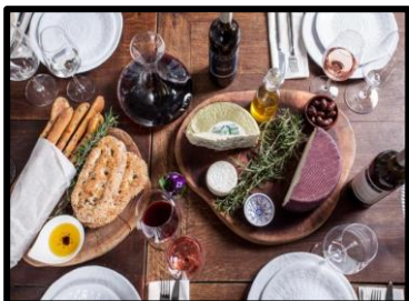
Lunch & Wine-tasting

For early arrivals, depart with your arranged transfer from Tel Aviv at 9:00am (location TBD) for Caesarea , once the Roman capital of the region. During your tour, see the ancient ruins and excavations of the former Crusader city, the historic aqueduct, and the old amphitheater that has been restored as a concert venue.