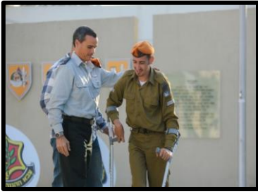
Special in Uniform

Following breakfast and hotel checkout, depart for the Hatzerim Air Force Base and see JNF's Special in Uniform , a unique initiative that integrates special needs youth into the IDF and assists in preparing them for career placement following army service. Meet with soldiers and hear about how this program instills valuable social, professional, and personal development skills. Pending confirmation, meet with Lt. Col. (Res.) Tiran Attia, Director of Special in Uniform .