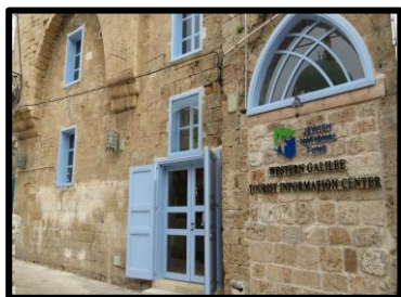
Western Galilee Visitor Center