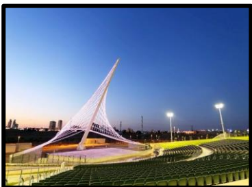
Be'er Sheva Amphitheater

Following an early 5:30pm dinner at the hotel, depart to Halutza , where 21st century pioneers are transforming this remote corner of the Negev desert into viable, vibrant communities. Meet with local residents to celebrate the holiday of Sukkot and observe Simchat Torah , the completion of the annual Torah reading cycle. Enjoy a festive evening filled with dancing, singing and time-honored traditions for an unparalleled authentic experience of this joyous occasion that gives thanks to the fall harvest.