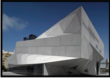
Tel Aviv Museum of Art