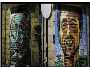
Shuk Shutters at night

Later on, consider joining an optional evening adventure to the Shuk to see the new after-hours art gallery called “ When the Shutters Close ”, which portrays modern day heroes, scholars and musicians in a contemporary, graffiti-style art.