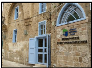
Western Galilee Visitor Center

Enjoy your first meal together with an opening lunch & wine-tasting at Tishbi Winery , which overlooks the estate's lush vineyards. Dine on local cuisine of fresh vegetables, homemade breads, and fresh cheeses from the nearby Yaakov and Meiri Dairy farms.