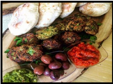
Home hospitality lunch