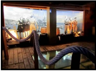
Atlit Illegal Immigration Camp

Following a delicious Israeli breakfast, checkout and depart the hotel at 8:30am for Atlit Illegal Immigration Camp , a detention camp where thousands of Jewish immigrants were once imprisoned upon their arrival into Israel during the British Mandate. See the restored Galina ship, a replica of a ship that carried 122,000 “illegal” immigrants in defiance of the British blockade to Israel.