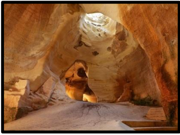
Beit Guvrin Caves