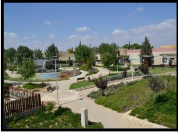
Aleh Negev village