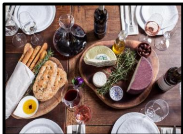
Lunch & Wine-tasting