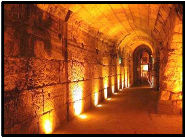
Western Wall Tunnels

The remainder of the day will be spent in the Old City of Jerusalem . After grabbing a quick lunch on own from one of the local food vendors, embark on your comprehensive walking tour. Explore the historic Jewish & Christian Quarters ; see the original steps that led to the Temple Mount at the Southern Wall Excavations ; and take time for silent contemplation at the Kotel , where Jews from around the world gather and pray. End with an exciting tour through the Western Wall Tunnels , an incredible labyrinth of underground arches, tunnels, and passageways. Afterward, enjoy free time to shop for last-minute gifts and souvenirs before departing Jerusalem.