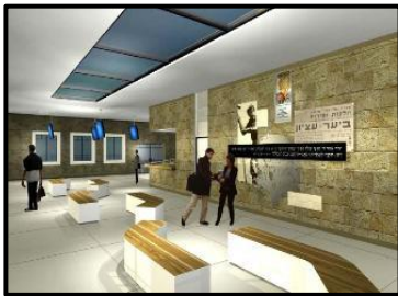
Gush Etzion Visitor Center

Overnight, Cramim Hotel & Spa, Judean Hills