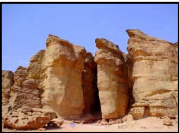
Solomon's Pillars at Timna Park

Early this evening, proceed to Timna Park , a site of great historical significance and a premier recreation destination for Israelis and tourists. Pass through the front gates to the chronosphere and become immersed in a fascinating 360-degree multi-media experience called the Mines of Times. Learn about ancient Egyptian and Midianite cultures dating from the time of the Exodus.