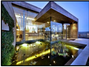
Cramim Hotel and Spa