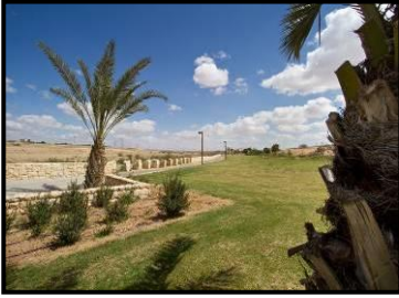
Be'er Sheva River Park

aspirations, values, and experience with sustainability principles, modern day science, and cutting-edge technologies. Meet with Bedouin community members who will share how Wadi Attir has impacted their lives.