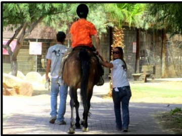
Therapeutic Riding Center

Enjoy a picnic lunch in Sapir Park, an oasis in the desert. Afterward, visit the Arava International Center for Agricultural Training (AICAT) , an agriculture work-study program where students from Asia learn farming practices and agricultural techniques to bring back to their home countries.