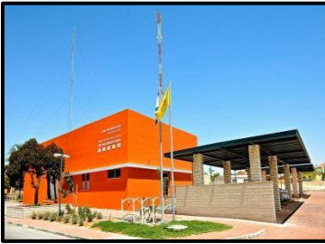
Central Arava Medical Center

Following breakfast and hotel checkout, head to the Central Arava to see, first-hand, how JNF is transforming the region and revolutionizing the land and lives of the people who live there. Gain insight into the complex challenges and obstacles facing the region, hear updates on JNF's work to attract new residents and visitors and see the progress being made in the Arava.