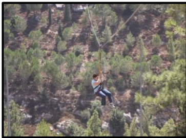
Zip-lining in Gush Etzion

Afterward, explore modern-day Gush Etzion and see how the region has transformed into a leading center of tourism. Enjoy some of the area's unique experiences with an optional zip-lining activity, a visit to a local brewery or winery and lunch at local restaurant.