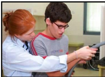
Aleh Negev Rehabilitative Village

Continue to Aleh Negev , a state-of-the-art residential facility that provides people with severe cognitive and developmental disabilities with high level medical and rehabilitative care. A revolutionary facility that has changed the face of rehabilitative care in Israel, Aleh Negev is home to over 500 residential adults with disabilities and serves more than 12,000 children and young adults with disabilities each year on an outpatient basis. Following a tour of the clinic, meet General Doron Almog , Chairman of Aleh Negev and former Commander of the IDF Southern Command, who will share memories of his late son Eran, who inspired him to become the Chairman of Aleh Negev.