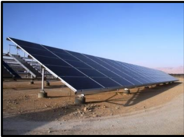
Solar Fields in the Arava

This afternoon, visit the Arava Institute for Environmental Studies (AIES) , the leading graduate level environmental education institute in the Middle East, which brings Israelis, Palestinians and Jordanians together to help solve environmental challenges - not through disagreement - but through true coexistence. Meet with current students and staff who will share how they cross boundaries to create a vibrant - and more tolerant - Israel.