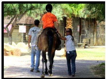
Therapeutic Riding Center

Proceed to Kibbutz Yahel , a vibrant agricultural kibbutz with a focus on the tourism industry. JNF is continuing its long-standing partnership with Kibbutz Yahel and developing a recreational and educational park in the heart of the Southern Arava that will be a tranquil, green retreat for tourists and travelers. Called Paradiso Arava, this five-acre compound will not only bolster the kibbutz's existing eco-tourism industry, but it will also provide much-needed employment opportunities that will attract new residents and continue the growth and sustainability of the kibbutz.