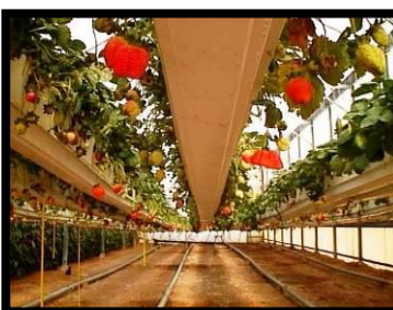
R & D Station

Enjoy lunch with Mayor Eyal Blum of the Central Arava for an in-depth overview of recent developments in the Arava and the efforts to attract new residents and visitors to the region.