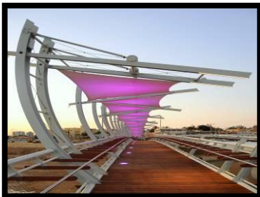
Pipes Bridge in Be'er Sheva