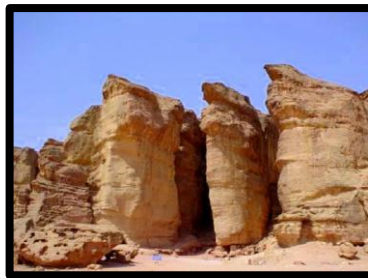
Solomon's Pillars at Timna Park

Following breakfast, transfer to the airport for a flight to Eilat . Upon arrival, proceed to Timna Park . Pass through the front gates to the newly built chronosphere and become immersed in a fascinating 360-degree multimedia experience called the Mines of Time. Through a dramatic audio-visual computer simulation and state-of-the-art animation, learn about ancient Egyptian and Midianite cultures dating from the time of the Exodus - a prelude to what we'll encounter further into the park.