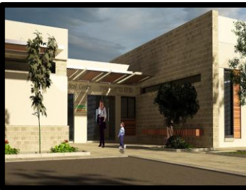
Central Arava Medical Center

Afterward, proceed to the new Central Arava Medical Center in Sapir. In partnership with the Central Arava Regional Council and the Israeli government, JNF is building a world-class medical center to replace the dilapidated clinic and provide quality care to local residents and workers. Meet several Arava doctors who will explain how the medical center will improve the quality of life and care for those who need it most.