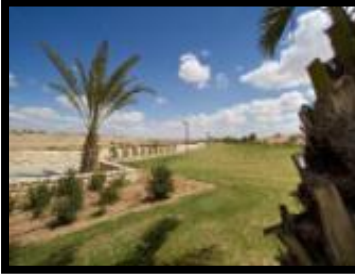
Be'er Sheva River Park