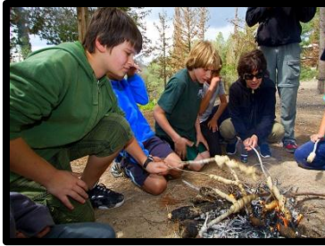
Green Horizons activity