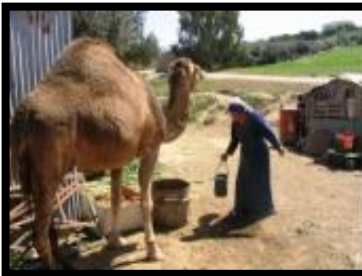
Project Wadi Attir

Following breakfast and hotel check-out, depart for the Central Negev. Visit Halutza , where several communities have been established for the Gush Katif evacuees. During a tour, see Halutza's organic vegetable farms and greenhouses that are flourishing despite their desert surroundings.