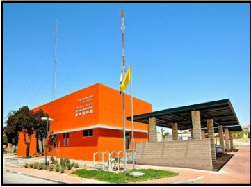
Central Arava Medical Center

Afterward, proceed to the Central Arava and see first-hand how JNF is transforming the region by revolutionizing the land and the lives of residents. Gain insight into the complex challenges and obstacles facing the Arava; hear updates on JNF's work to attract new residents and visitors; and see the overall progress and development.