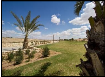
Be'er Sheva River Park