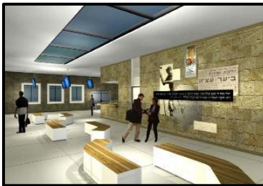
Gush Etzion Visitors Center

Afterward, proceed to the historic Gush Etzion , site of one of the deadliest battles during the War of Independence. Visit the Gush Etzion Visitor Center , home to a new memorial which commemorates the heroic men and women who gave their lives to protect the communities of the Etzion Bloc- strategically located between Jerusalem and Hebron.