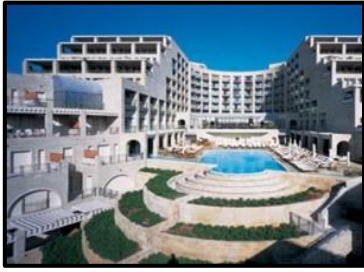
David Citadel Hotel