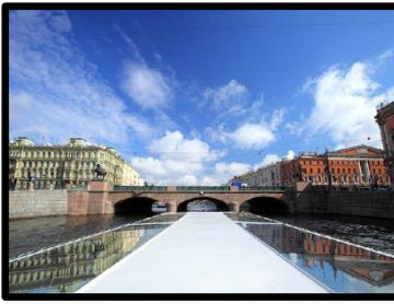
Canal in St. Petersburg

Petersburg residents of all ages. Meet with community members and learn more about the Jewish community in St. Petersburg.