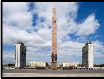
Monument to the Heroic Defenders of Leningrad

Time pending, pay a visit to the Center of Jewish Arts and Crafts in Gatchinskaya Street, known for its large display of yarmulkes, candelabra, menorah, challah covers and paintings with a Jewish theme.