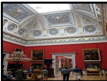
Inside the Hermitage Museum

Overnight, Astoria Hotel, St. Petersburg