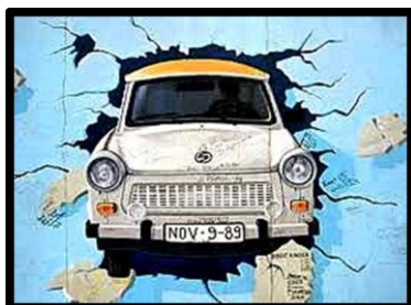
East Side Gallery - Berlin Wall