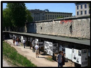
Topography of Terror

From here we will proceed to the Jewish Museum (Jüdisches Museum) . Designed by Philip Gerlach, this museum was built in 1735 and served as Collegienhaus to the regal Court of Justice. It was redesigned in the 19th century but almost completely destroyed during the Second World War. The building was remodeled one more time in 1993 by Daniel Libeskind. The museum features exhibits on Jewish culture in Germany during the reign of the Third Reich; historical objects, documents and artworks of 2000 years of German-Jewish history.