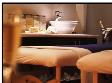
Spa at Carmel Forest

in Sderot and explain how the Recreation Center has positively influenced their lives and the city.