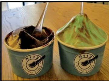
Bouza ice cream