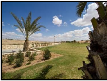
Be'er Sheva River Park