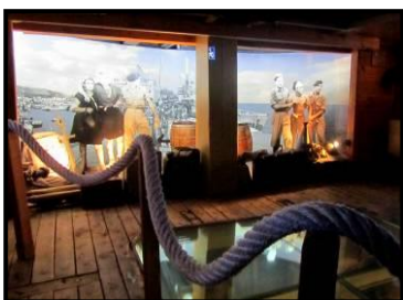
Atlit Illegal Immigration Camp