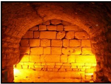
Western Wall Tunnel

This evening, enjoy dinner at a local restaurant with special guests. Lone Soldiers will join the group and share their personal experiences of leaving their homes and loved ones in order to serve the state of Israel in the IDF.