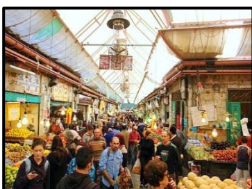
Mahane Yehuda Market

Following the Herzl Museum tour, proceed to the colorful Mahane Yehuda Market . Become immersed in the bustling energy of Jerusalem’s shuk and enjoy lunch on your own.