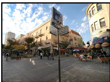
Ben Yehuda Street