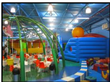
Sderot Indoor Recreation Center