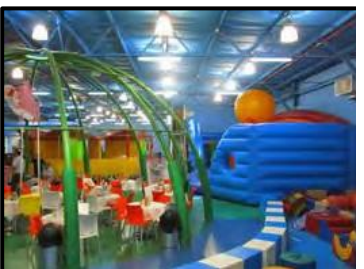
Sderot Indoor Recreation Center