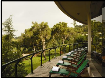
Carmel Forest Spa Hotel