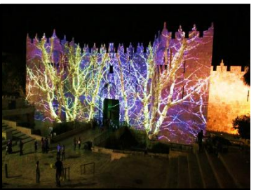
Festival of Lights

Continue to the Begin Museum , which highlights the life and work of Prime Minister Menachem Begin. The museum takes visitors on a time-journey that includes historical reconstructions and reenactments, rare dramatic documentary videos, and interactive touch-screen exhibits.