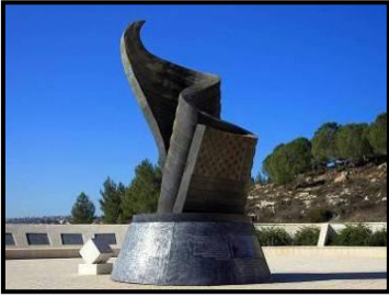
9/11 Living Memorial