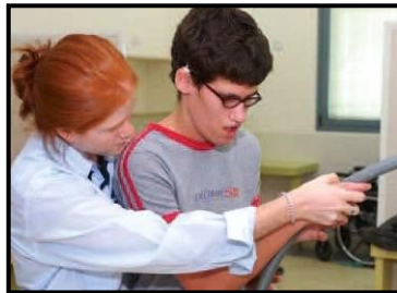
Aleh Negev Rehabilitative Village

This afternoon, we will head to Halutza , where several communities have been established in result of the Gush Katif evacuees. Enjoy lunch with Halutza residents, who will share their experiences and stories of rebuilding their lives here. During a tour, visit the new on-site JNF Medical Center and see the blooming organic vegetable farms and greenhouses that are flourishing in their desert surroundings.