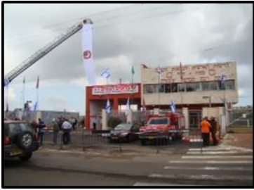
Usafiya Fire Station

Overnight, Carmel Forest Spa Hotel, Haifa