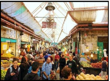
Mahane Yehuda Market

Afterward, head to the colorful Mahane Yehuda Market . During a tour, sample some of the local spices, taste the fresh produce, stop at the local butcher stand, and meet the local fishmonger. Enjoy some time on your own to become immersed in the bustling energy of Jerusalem's Shuk, join local Jerusalemites in their weekly tradition of shopping, and enjoy lunch on own.