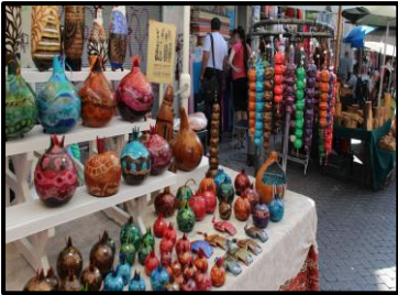
Nahalat Binyamin Crafts Fair

Later this afternoon, continue to the Nahalat Binyamin Crafts Fair for a festival of arts, crafts, pottery, and street performances. Stroll through Tel Aviv's famous Carmel Market and capture all the liveliness and vibrancy of this iconic bustling focal point. Enjoy lunch on your own from one of the many food vendors or local cafés.