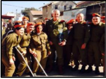
Special in Uniform

Following a delicious Israeli breakfast, depart the hotel at 8:15am for the Tze'elim Army Base . After an exclusive tour, see an exciting live-shooting demonstration. Meet with Colonel (res.) Bentzi Gruber , Vice Commander (reserves) of Division 252, an armored division of 20,000 soldiers. Hear his famous presentation on "Ethics in the Field" , which debunks current myths in lieu of hard facts missing in today's discussion of Israeli counter-terrorism. Afterward, learn about JNF's Special in Uniform , a powerful program that integrates youth with disabilities into the Israel Defense Forces and assists in preparing them for careers following army service.