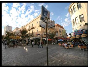
Ben Yehuda Street