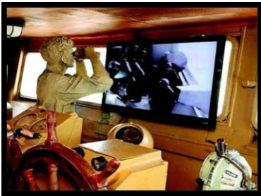
Atlit Illegal Immigration Camp

We will continue to Atlit Illegal Immigration Camp , which JNF helped restore in partnership with the Society for the Preservation of Israel's Heritage Sites (SPIHS). Converted into a detention camp by the British Mandate, Atlit imprisoned thousands of Jewish immigrants upon arriving into Israel. After a tour, we will continue to the restored Galina ship, a replica of a ship that carried 122,000 “illegal” immigrants in defiance of the British blockade to Israel.