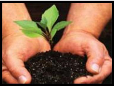
Planting a Tree

Following breakfast at the hotel and check out, we will visit the newly renovated Israel Museum , one of the leading art and archeology museums in the world. During our tour, we will stop at the Shrine of the Book to see the Dead Sea Scrolls, the oldest biblical manuscripts in the world. We will also see the new Holy Land Model, a miniature replica of Jerusalem as it was during the Second Temple Period.