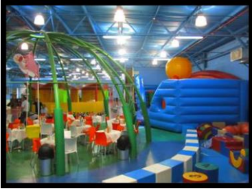
Sderot Indoor Recreation Center

This morning we will drive south to the Negev . Our first visit will be JNF's Sderot Indoor Recreation Center , the largest indoor playground in Israel. This fortified facility provides Sderot's youth with a safe, secure place to have fun and simply be children. We will meet with Sderot residents to understand how the indoor playground has enriched their lives.