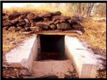
Bunker at Mitzpe Gadot

We will begin in at Mitzpe Gadot , a former Syrian base and site of particularly harsh battles during the 1967 war. As we walk through an old army bunker, we will see what life was like for soldiers manning the outpost.