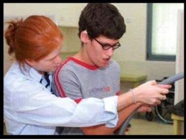
Aleh Negev Rehabilitative Village

This morning we will drive south to the Negev . Our first visit will be JNF's Sderot Indoor Recreation Center , the largest indoor playground in Israel. This fortified facility provides Sderot's youth with a safe, secure place to have fun and simply be children. We will meet with Sderot residents to understand how the indoor playground has enriched their lives.