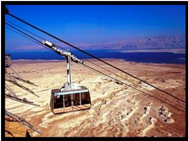
Cable car ride to Masada

Or, consider participating in an optional day tour to Masada and the Dead Sea . The optional tour will depart the hotel in the morning and head south along the shores of the Dead Sea, the lowest place on earth. Continue to Masada for a cable car ride to the top of the Herodian Palace Complex. Visit the ancient fortress where the Zealots made their last stand against the Romans and see the remains of the walls, palaces, synagogues, water cisterns, mosaic floors and roman baths. During the tour, hear the heroic story of the Jewish fighters.