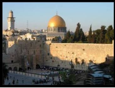
Old City of Jerusalem

Following a delicious Israeli breakfast at the hotel, we'll meet our guide and depart for the Old City of Jerusalem. We will begin with a driving tour to explore ancient Jerusalem followed by a visit to the Western Wall , the last remaining wall that enclosed the Temple Mount in the Second Temple Period. We'll hear the soft sounds of prayer and contemplation before we continue to the Southern Wall Excavations to see the original steps that lead to the Temple Mount.