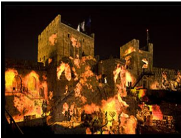
Light & Sound Show

This evening, we will head to the Tower of David , to see the Light and Sound Show , a cutting edge pyrotechnics show that unfolds with a blaze of images that tell the story of Jerusalem's rich history.