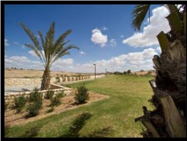
Be'er Sheva River Park

Following lunch in the home of a local resident, we will head to the new community of Givot Bar . In partnership with the OR Movement, JNF has played an integral role in Givot Bar's growth, helping to create a desirable community that offers a quality of life not available in Israel's crowded center. During a tour of the community, meet with several Givot Bar residents who will share their experiences forging new lives in the Negev and discuss what life is like as a true modern day pioneer.