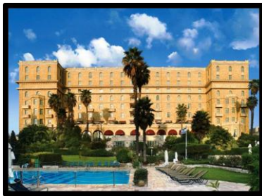
King David Hotel