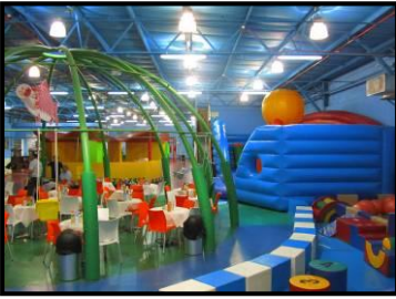
Sderot Indoor Recreation Center