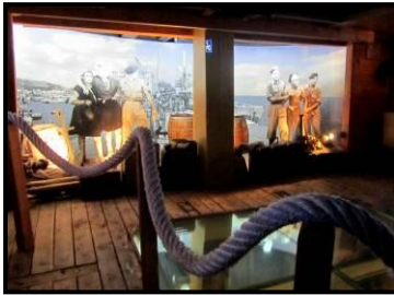
Atlit Illegal Immigration Camp

This morning we will visit the port city of Haifa , also known as the “capital of the north” and the hub of Israel’s technology and research industries. We’ll tour the Baha’i Hanging Gardens , a UNESCO World Heritage Site that is described as the “eighth wonder of the world.”