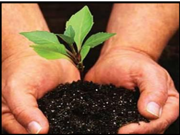
Planting a Tree

Later this afternoon, we'll continue to Neot Kedumim , an eco-tourism site and "living museum" that recreates the physical setting of the Bible in all its depth and detail. Following a tour, we'll continue to the Harvey Hertz - JNF Ceremonial Tree Planting Center , which serves as JNF's primary planting center in Israel. Here, we will each have the opportunity to plant a tree and contribute to JNF's ongoing afforestation efforts in Israel.