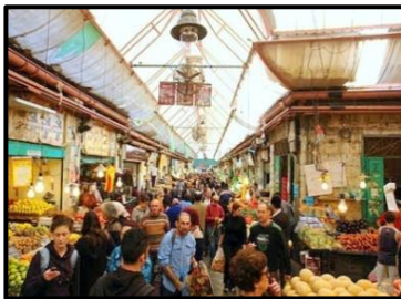
Mahane Yehuda Market