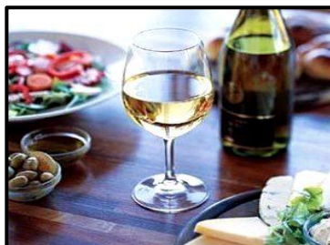
Wine tasting and lunch