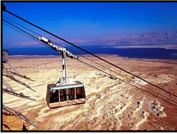
Cable car ride to Masada

ride to the top of the Herodian Palace Complex. Visit the ancient fortress where the Zealots made their last stand against the Romans and see the remains of the walls, palaces, synagogues, water cisterns, mosaic floors and roman baths. During the tour, hear the heroic story of the Jewish fighters.