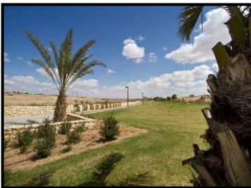
Be'er Sheva River Park