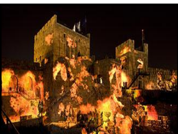
Light & Sound Show