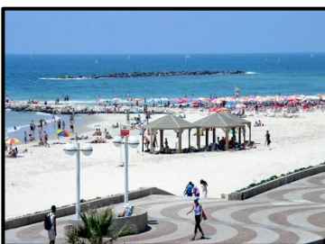
Tel Aviv Beach