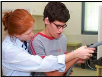
Aleh Negev Rehabilitative Village