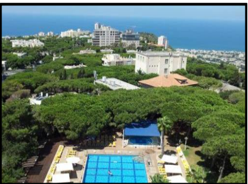
Dan Carmel Hotel