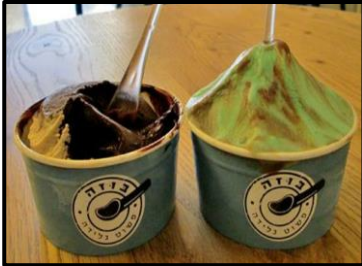
Bouza Ice Cream

Following breakfast and hotel check-out, we will depart Jerusalem and drive north along the scenic coastal route. We will visit Atlit Illegal Immigration Camp , which JNF helped restore in partnership with the Society for the Preservation of Israel's Heritage Sites (SPIHS). Converted into a detention camp during the British Mandate, Atlit imprisoned thousands of Jewish immigrants upon their arrival into Israel. The tour will include the restored Galina ship, a replica of a ship that carried 122,000 "illegal" immigrants in defiance of the British blockade to Israel.