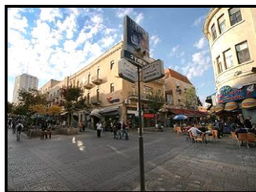
Ben Yehuda Street

After a falafel lunch in the Old City, we will have some time to explore Ben Yehuda Street , Jerusalem's open-air pedestrian mall filled with cafes, outdoor shops and the sounds of musicians playing on the street.