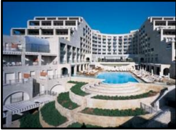
David Citadel Hotel