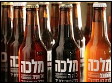
Beer from Malka Brewery

Continue to Tarshiha village to visit the Bouza Ice Cream Parlor for dessert. Founded as a partnership between an Arab Muslim and a Jewish kibbutznik couple, the ice cream parlor attracts a diverse clientele of Muslims, Christians and Jews from Israel and abroad. During a conversation with the restaurant's owners, understand how the ice cream parlor embodies peaceful coexistence and reflects the diverse and complex nature of Israeli society. Take a tour, meet the owners, and don't forget to try the delicious ice cream!