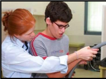
Aleh Negev Rehabilitative Village