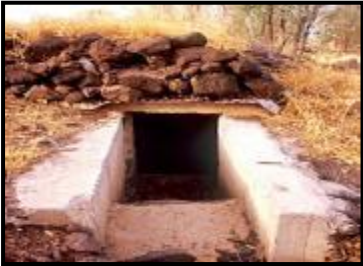
Bunker at Mitzpe Gadot

This morning, we will explore the Golan Heights , one of Israel's most beautiful and strategic regions. As we follow in the footsteps of Israel's IDF Soldiers and their battles during the Six-Day War, we'll gain insight into the complexities of the region. Our tour begins at Mitzpe Gadot , a former Syrian base and site of particularly harsh battles during the 1967 war. As we walk through an old army bunker, we will see what life was like for soldiers manning the outpost.