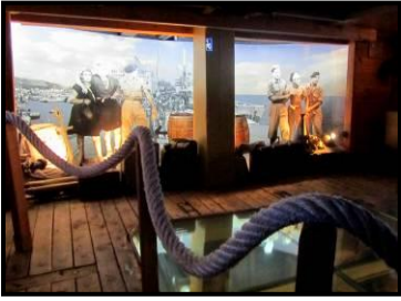
Atlit Illegal Immigration Camp

Following breakfast and hotel check-out, we will depart Jerusalem and drive north along the scenic coastal route. We will visit Atlit Illegal Immigration Camp , which JNF helped restore in partnership with the Society for the Preservation of Israel's Heritage Sites (SPIHS). Converted into a detention camp during the British Mandate, Atlit imprisoned thousands of Jewish immigrants upon their arrival into Israel. The tour will include the restored Galina ship, a replica of a ship that carried 122,000 "illegal" immigrants in defiance of the British blockade to Israel.