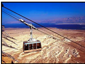
Cable car ride to Masada

Today will be at leisure in honor of Shabbat. Consider one of these optional activities for the day: