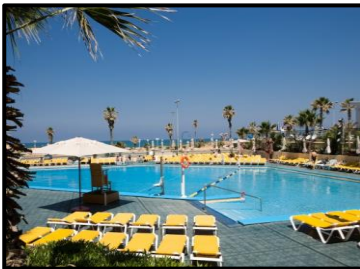
Dan Panorama pool