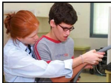
Aleh Negev Rehabilitative Village