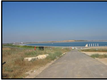
Nir Am Reservoir