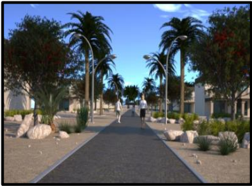
Central Arava community

Following breakfast and hotel checkout, stop at the Ramon Crater , a unique geological phenomenon similar to a crater that can only be found in the Negev. See the colorful landscapes and hidden treasures within the largest Maktesh in the world.