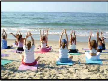
Yoga on the Beach