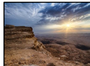
Desert region of Mitzpe Ramon

Following breakfast, check out of the hotel and head south to Sderot . Visit the Sderot Indoor Recreation Center , the largest indoor playground in Israel. This fortified facility provides Sderot's youth with a safe, secure place to have fun.