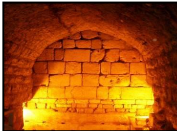
Western Wall Tunnels

Afterward, take a tour of Ammunition Hill , site of the famous Six-Day War battle. Walk through the battleground and bunkers on a tour that follows the footsteps of the soldiers who fought here. See the new “Seam-Line” multimedia show about the Six-Day War and the reunification of Jerusalem. End at JNF’s Wall of Honor, honoring Jewish veterans from around the world.