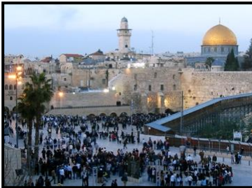
Kabbalat Shabbat at the Kotel

Today begins with an emotional visit to Yad Vashem Holocaust Museum & Memorial . Yad Vashem tells the story of the Holocaust from a uniquely Jewish perspective using original artifacts, survivor testimonies & personal possessions.