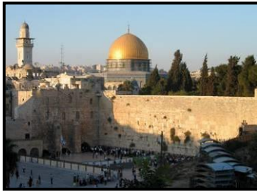
Old City of Jerusalem

After breakfast at the hotel, visit the Jerusalem Firefighters Visitor Center . Ranked among the best firefighting and rescue services in the world, Israeli firefighters are often the unsung heroes of Israel. After a tour, meet several firefighters who will share their personal experiences and then give an exciting demonstration of their unique skills.