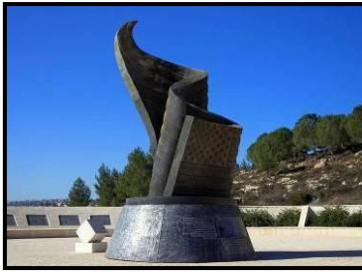
9/11 Living Memorial

After breakfast at the hotel, visit the Jerusalem Firefighters Visitor Center . Ranked among the best firefighting and rescue services in the world, Israeli firefighters are often the unsung heroes of Israel. After a tour, meet several firefighters who will share their personal experiences and then give an exciting demonstration of their unique skills.