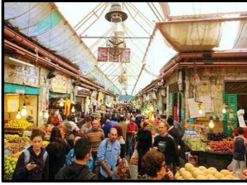
Mahane Yehuda Market