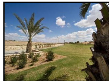
Be'er Sheva River Park